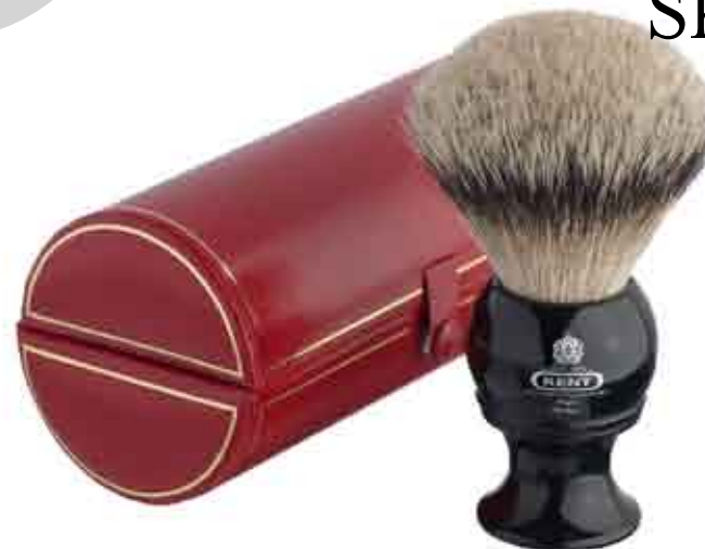
BLK4 Traditional medium, pure silver-tipped badger brush