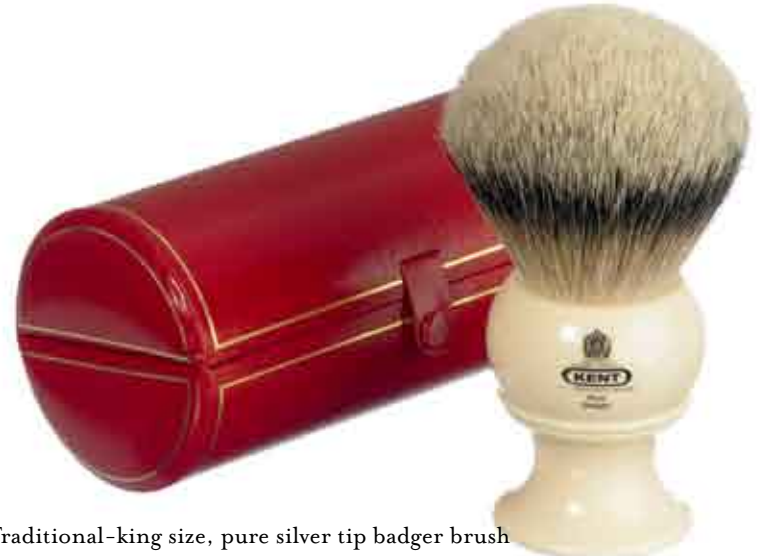
BK12 Traditional-king size, pure silver tip badger brush