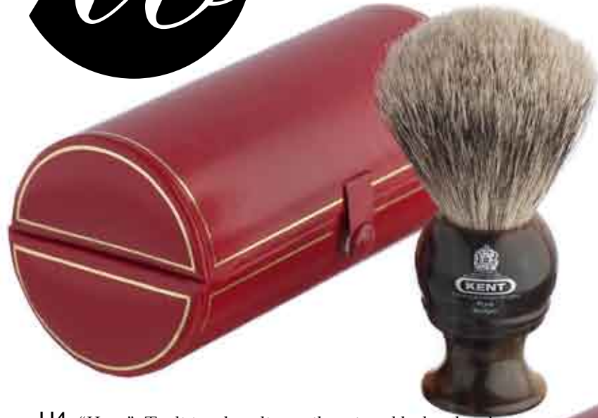
H4 "Horn", Traditional medium, silver tipped badger brush