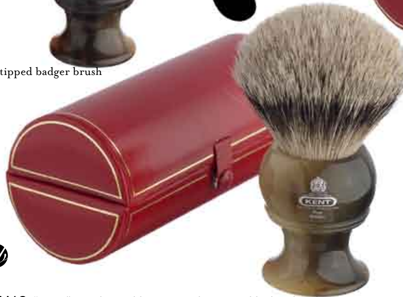
H12 "Horn", Traditional king size, silver tipped badger brush