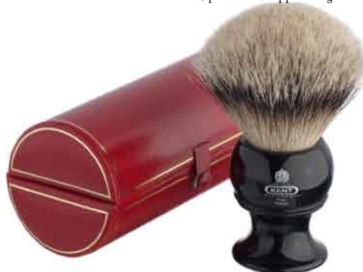
BLK12 Traditional king size, pure silver-tipped badger brush