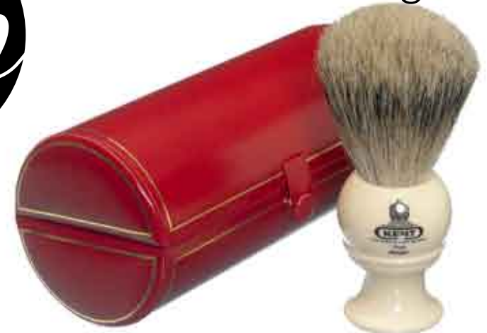
BK4 Traditional-medium pure silver tip badger brush