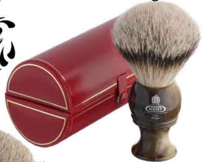
H8 "Horn", Traditional large, silver tipped badger brush