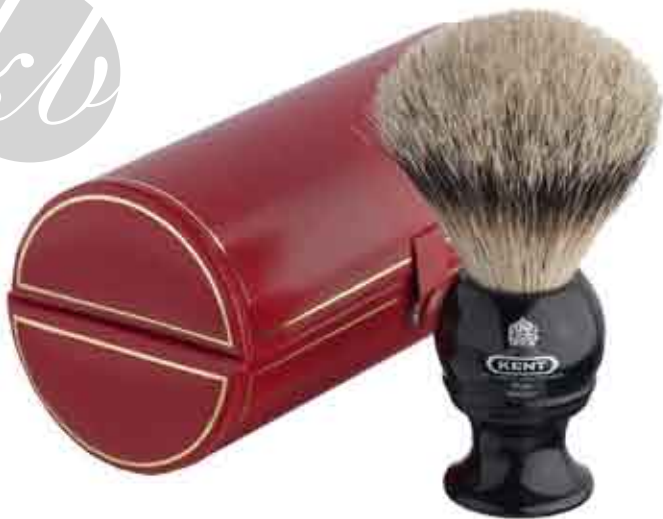
BLK8 Traditional large, pure silver-tipped badger brush