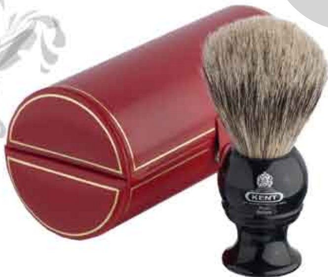
BLK2 Traditional medium, pure grey badger brush