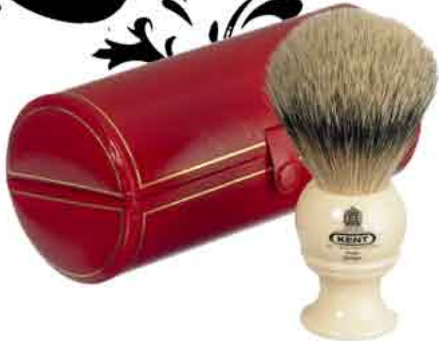
BK2 Traditional-medium pure grey badger brush