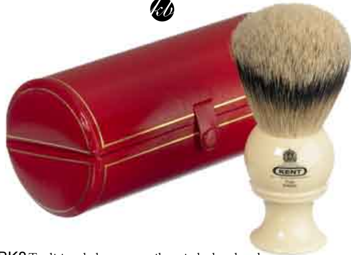
BK8 Traditional -large pure silver tip badger brush