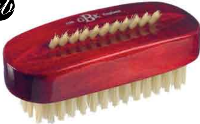
ART8 Nail - pure white bristle, row of bristle on back, also available in green and blue