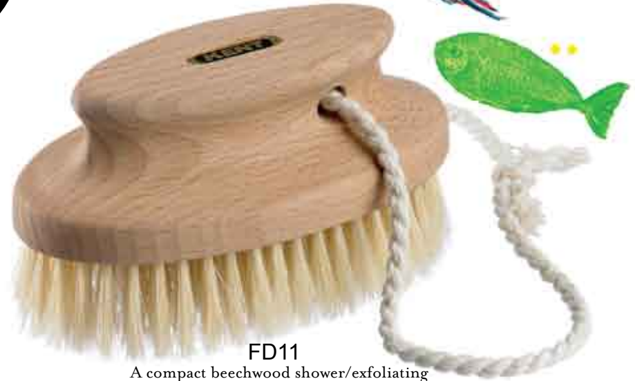
FD11 A compact beechwood shower/exfoliating brush, pure bristle, rope strap