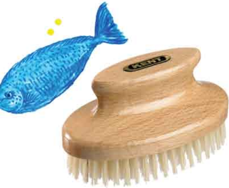
NB6 Nail - extra large oval, pure white bristle