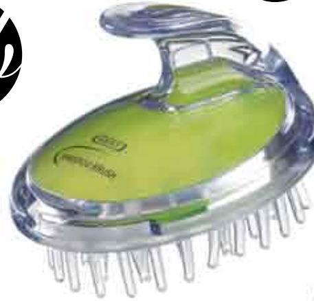
SH1 Shampoo and scalp massage brush, Available in orange, blue, yellow or lime